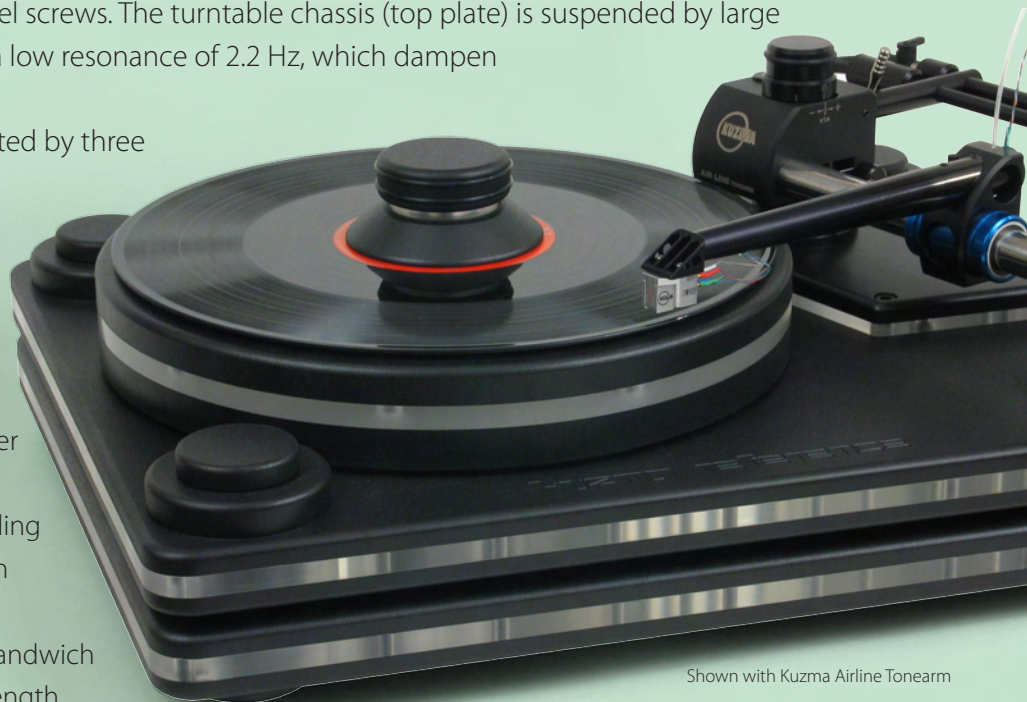
Shown with Kuzma Airline Tonearm

The power supply is similar to that for Stabi but with still higher quality components to provide further precision in control and a faster, smoother transfer of energy.